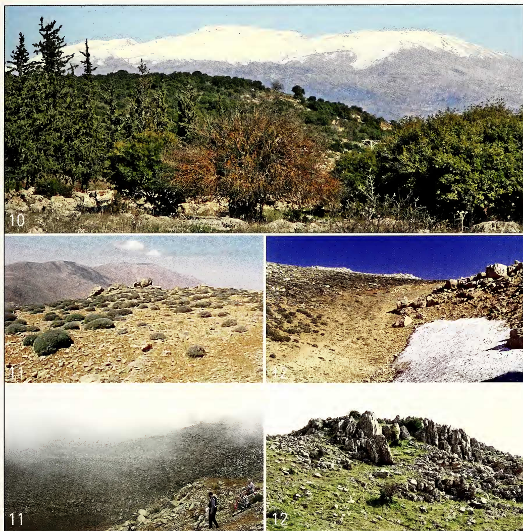
Figs 10–14. Habitat Amata gil sp. n. 10. View from Israel, towards the northeast, on the Hermon Mountain Range, with snow line at about 1500 m, mid winter. 11. View from Syria, towards the south, tragacanth vegetation on Mt Hermon on a wind-facing slope, about 2200 m, mid summer. 12. North-facing slope of Mt Hermon in Syria, about 2500 m, mid summer. 13. Large dolinas, a traditional collecting place on the Israeli part of the mountain ridge, near the upper cable station, about 2000 m, mid summer. 14. Rocky, south-facing summit with scattered bushes, near the lower cable station, about 1600 m, mid spring.

very low temperatures in winter, whereas summers are hot and dry. This situation creates specific plant communities dominated by spiny, round, dense, cushion-like shrubs such as Astragalus and Onobrychis (Danin 1988). The main water source in this area is melting snow, consequently most of this karstic mountain area is rather arid (Danin 1995). Only one specimen was collected in flight on a xerotherm, karstic slope about 1500 m with few scattered Rosa canina L. and Crataegus sp. bushes (Rosaceae) (see Fig. 1). The two specimens from Syria were collected sitting on flowers growing among Astragalus sp. bushes (see Fig. 3) in the late morning. A. gil appears to be a summer